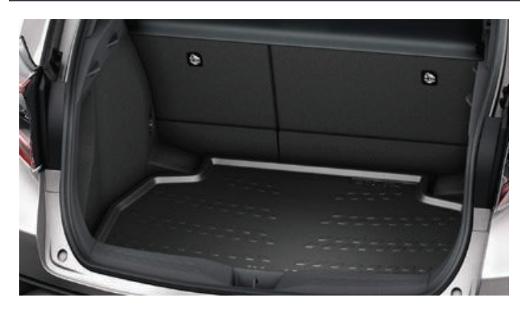
BOOT LINER Tailored to fit the boot of your vehicle and provide protection against dirt and spills.