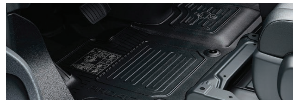
RUBBER FLOOR MATS The ultimate floor protection against mud, water, dirt and grime.

MUD GUARDS Designed to minimise water, mud and stones spraying onto your van's body.