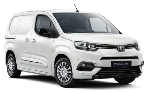
Icy White (EPR)