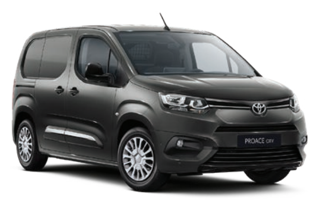
Dark Grey (EVL)