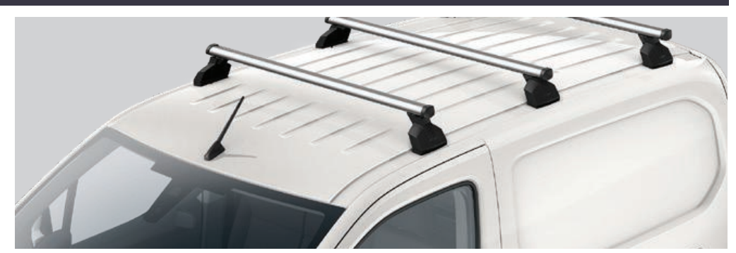
ROOF RACK (2 BARS) Lockable aerodynamic aluminium design that is easy to install and remove. It combines with a wide range of specialised carrying attachments.