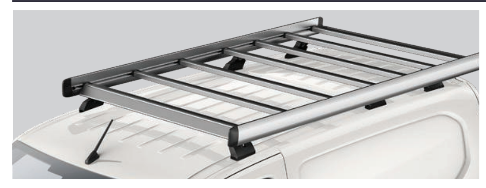
ALUMINIUM ROOF PLATFORM FOR SWB Heavy duty aluminium platform with integrated roller bar to facilitate loading.