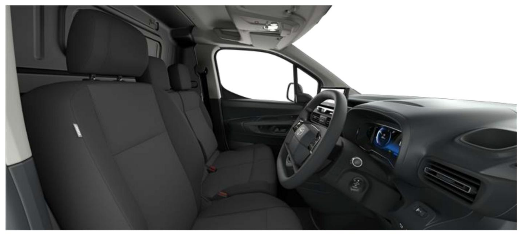
Grey fabric (CMFY)

Available in grey fabric with a unified black instrument panel that delivers a fresh image.