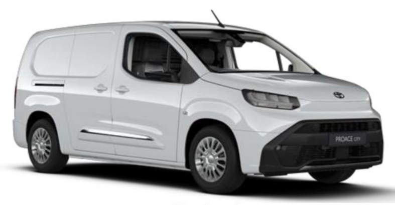
Icy White (EPR)