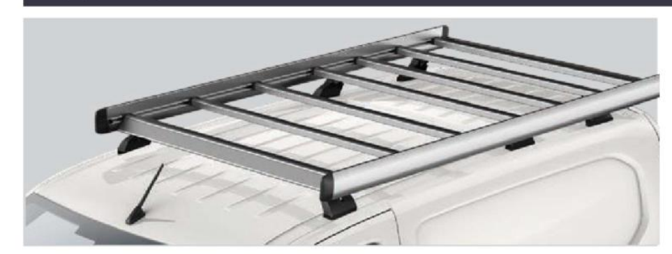
ALUMINIUM ROOF PLATFORM FOR SWB

Heavy duty aluminium platform with integrated roller bar to facilitate loading.